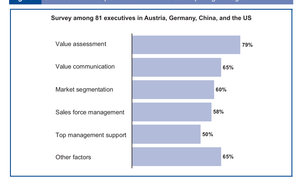
Figure 2 Obstacles to the implementation of value-based pricing strategies

reference value – plus the value of whatever differentiates the offering from the alternative – differentiation value."